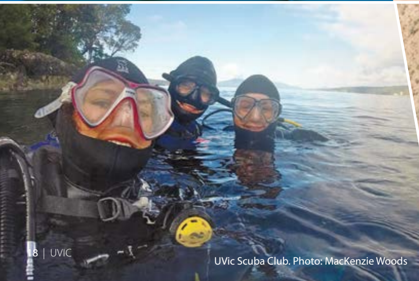
UVic Scuba Club.