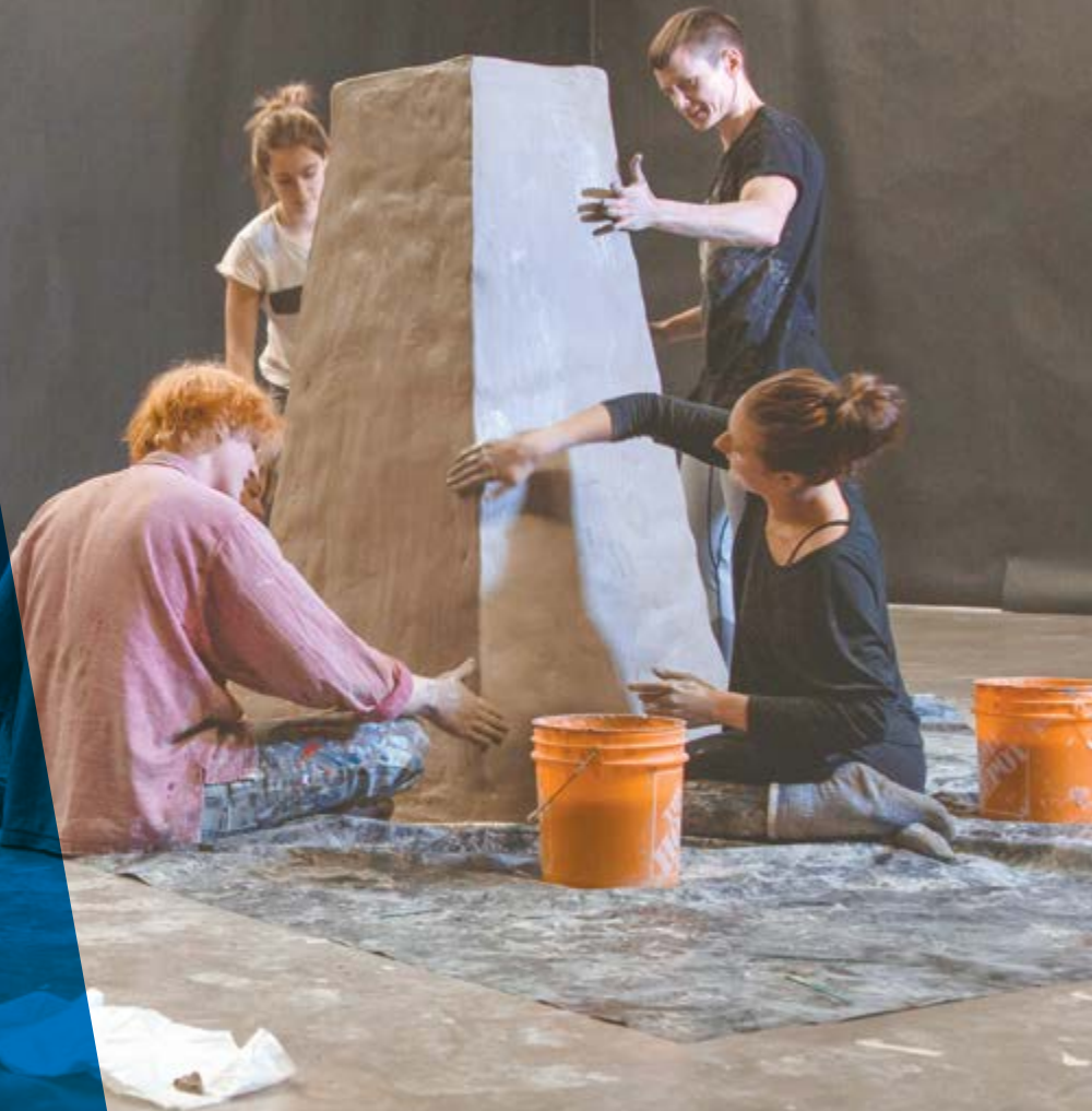
UVic visual arts students help internationally renowned trans artist Cassils prepare for their performance Becoming An Image .