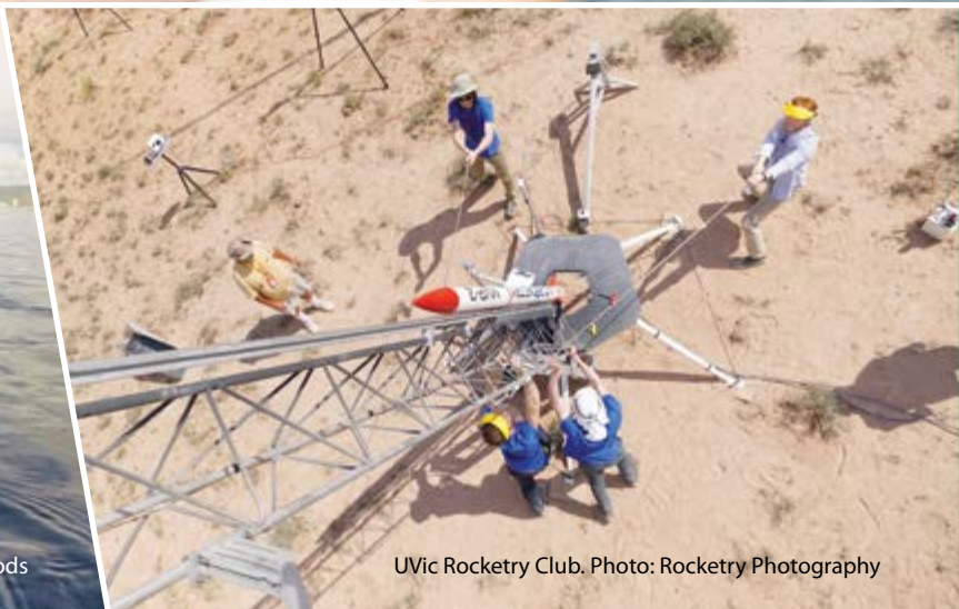
UVic Rocketry Club.