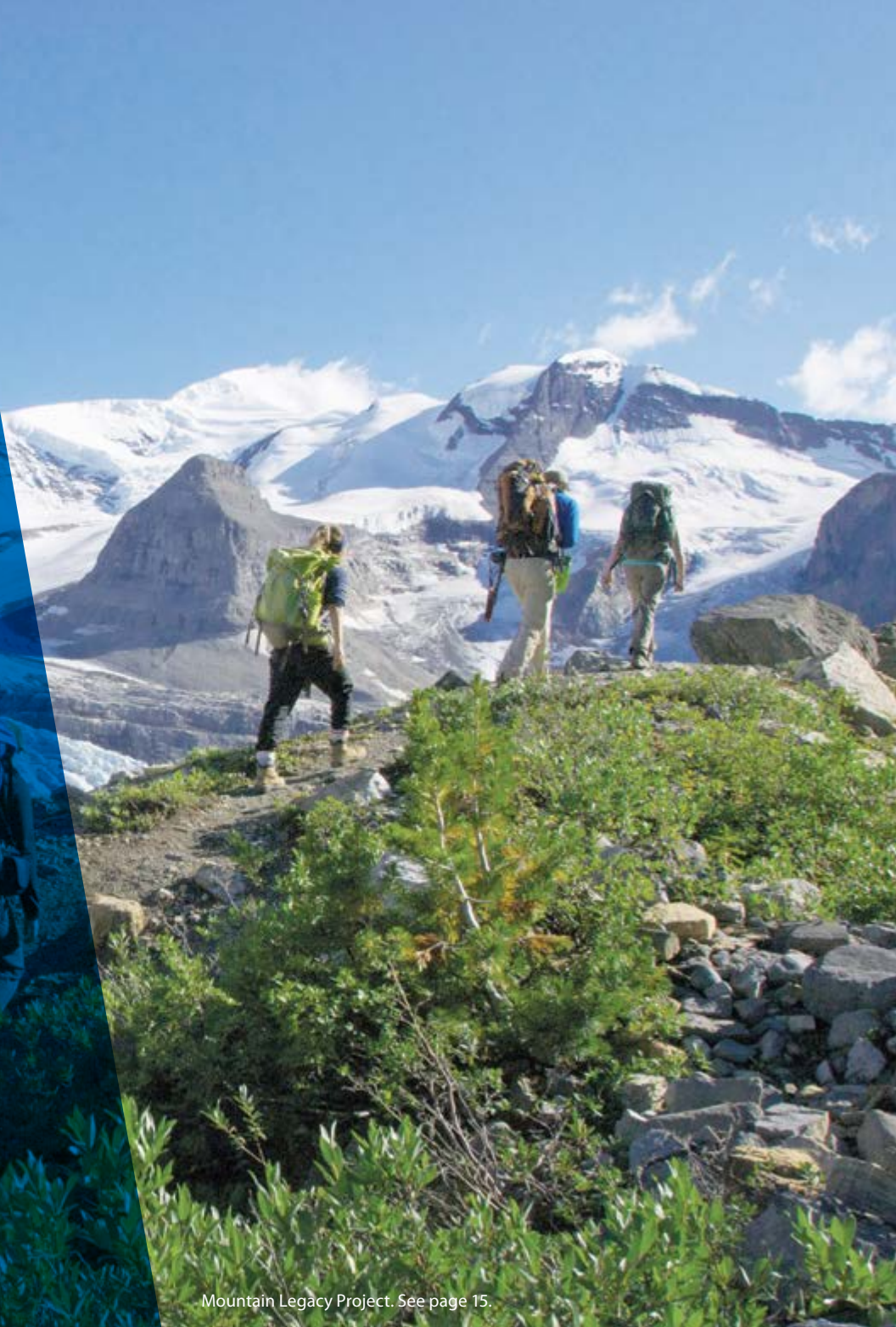
Mountain Legacy Project. See page 15.